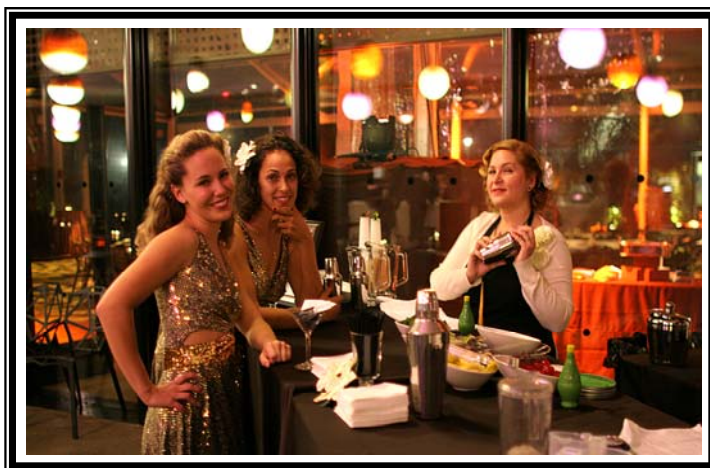
Our Deco Belles Welcome Guests for a Tea "Cocktail" at San Francisco's De Young Museum Opening Gala

Looking to add a unique twist to your next party? Try having a Tea "Cocktail" Bar where the exotic, luxurious and decadent is also gourmet, healthy and non-alcoholic. Whether your guests have seen it all and you'd like to include a new experience, or you want to provide another choice that offers something special that everyone can enjoy, the Exotic Tea Room "Cocktail" Bar is the fresh and original choice for your next event.