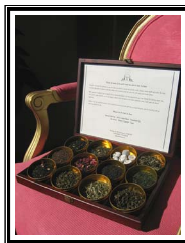
Custom Tea Sample Set

Caterings, Events & the Original Tea "Cocktail" Bar