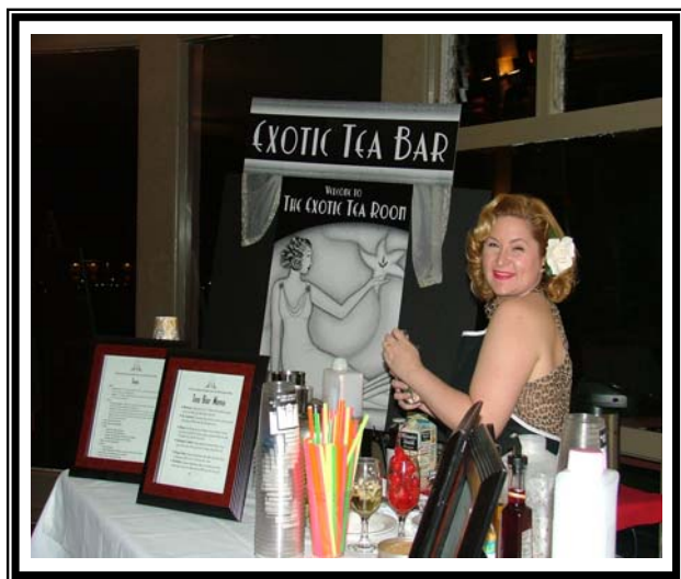
Tea "Cocktail" Bar at Community Karma Party

Through a sommelier-like experience, we open the doors to a world of exquisite tea gourmet in taste, beauty, health and quality. Our whole-leaf, seasonal, single estate, organic and competition grade teas come alive with unique and complex flavors.